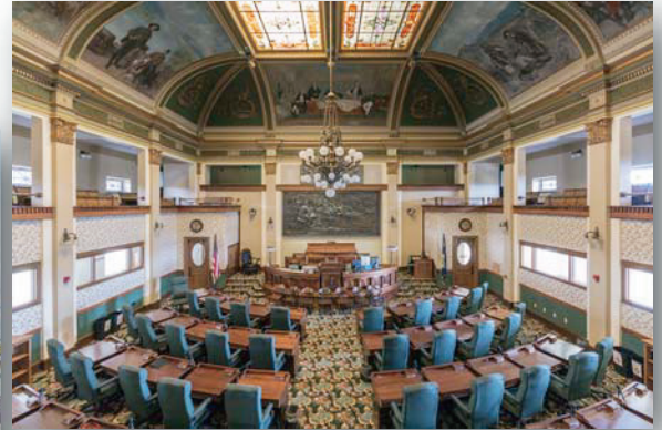
Montana Senate Chamber