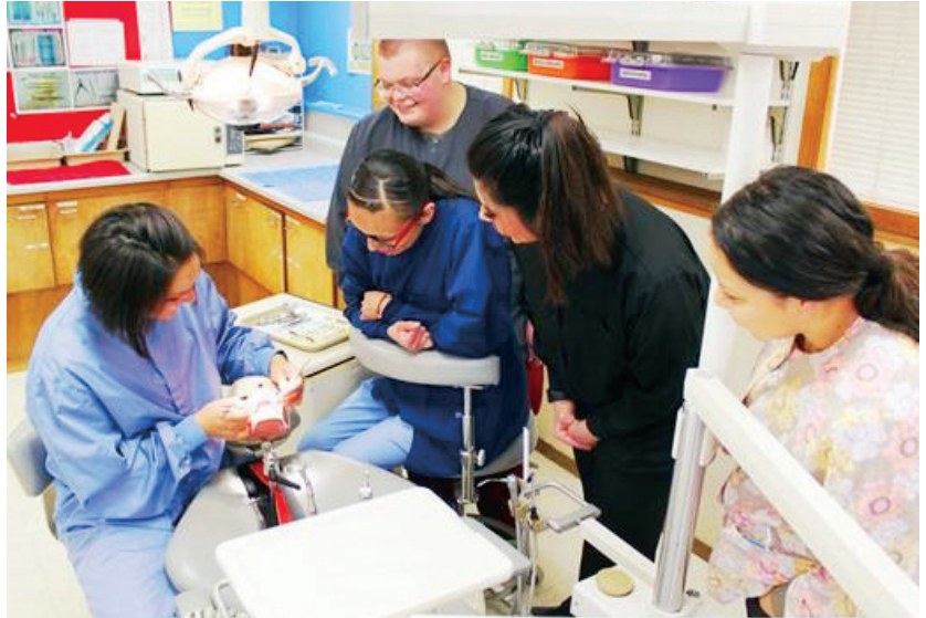
Dental assisting students observe an instructor demonstration.

MOHF also discussed how to further promote the Doug and Sue Hadnot Fund in the coming weeks at your dental society meetings. This fund was created last year in conjunction with the Montana Community Foundation to allow dentists to take advantage of the Montana Endowment Tax Credit in their giving. A $5,000 gift to this fund will be offset by nearly $3,000 in state tax credits and federal tax write-offs. MOHF is seeking 50 dentists to donate $5,000 to the fund in 2018. The more assets in the endowment, the higher our guaranteed return will be. Checks can be made out to the Doug and Sue Hadnot Fund and sent to the MDA office.