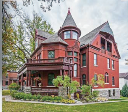
Original Governor's Mansion