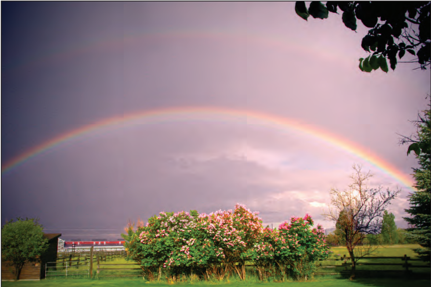
Rainbow over Helena