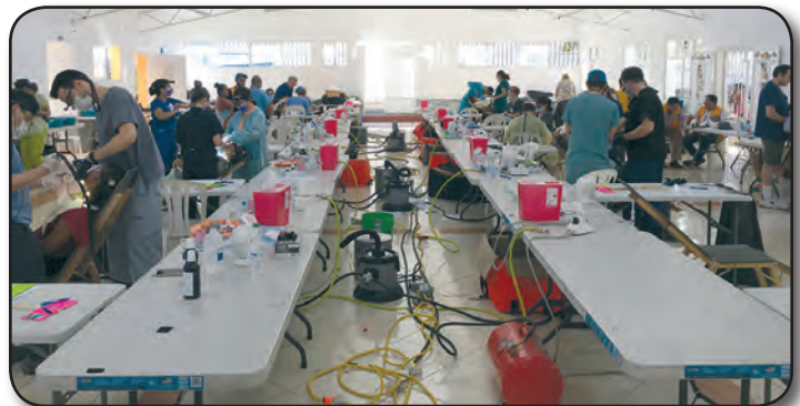
The Jutiapa, Guatemala clinic (directly above) and the waiting room (top).