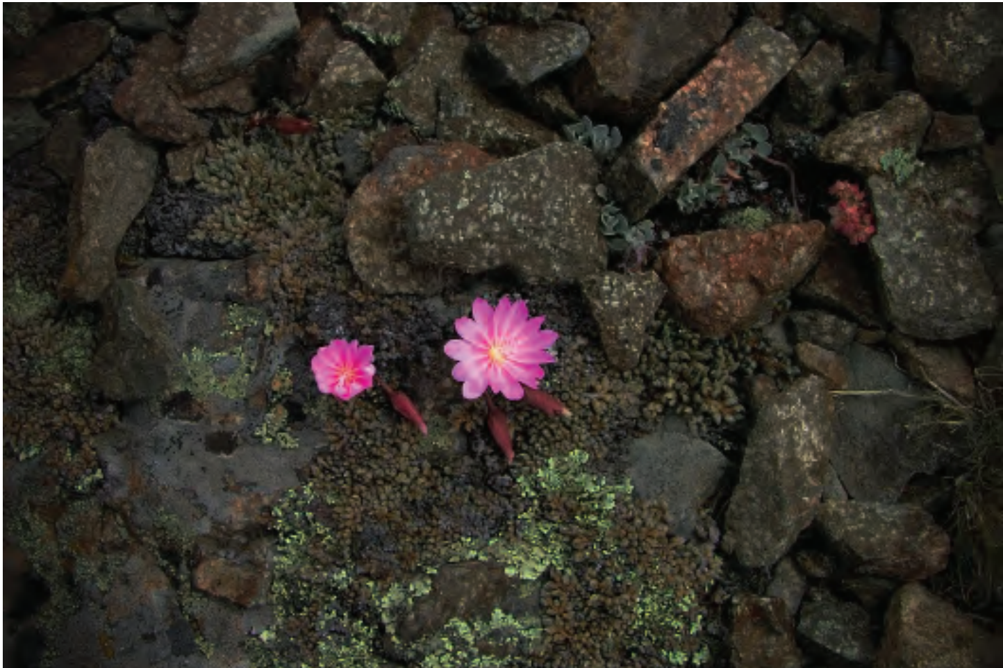
Montana State Flower, Bitterroot